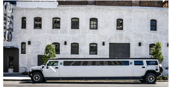
Hummer limo– 14-16 pax