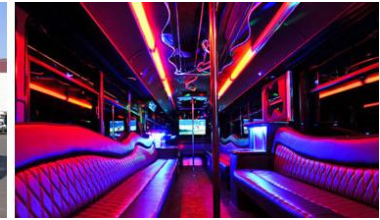
Party bus -12-14 pax